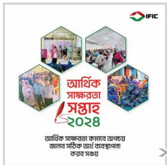
IFIC Bank conducted different financial literacy based activities around the year across the country