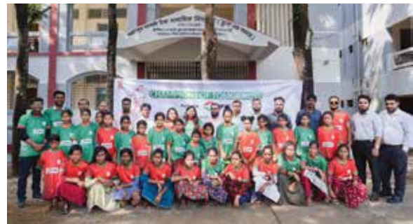
IFIC Bank took a significant step to support female athletes as part of its initiative to empower women